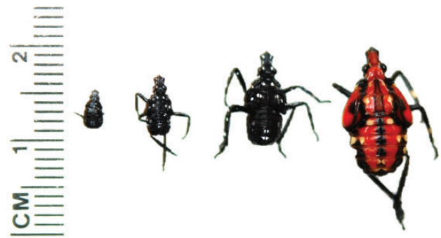
Fig. 2. L. delicatula passes through four nymphal instars. The first three instars (left to right) are black and ornamented with spots. The fourth instar develops red patterning on the dorsal side that covers in part the head, thorax, and abdomen, while still retaining some white spotting.