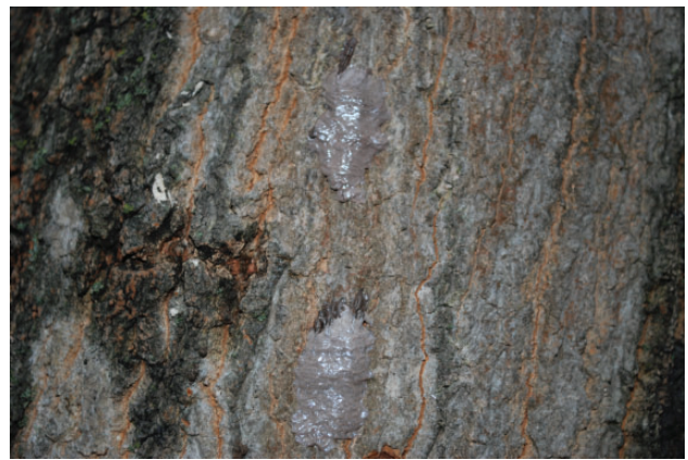
Fig. 1. Egg masses of L. delicatula covered by waxy deposits.

Adults and nymphs feed on phloem tissues of young stems and bark tissues with their piercing and sucking mouthparts and excrete large quantities of liquid (Ding et al. 2006). Adults and older nymphs will feed in groups, especially later in the season on preferred hosts.