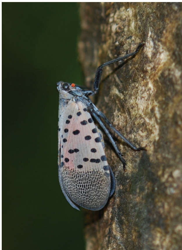
Fig. 4. Lateral view of a resting adult L. delicatula on A. altissima .

It is unclear to what extent natural enemies will control L. delicatula in North America. Natural enemies of other planthoppers in