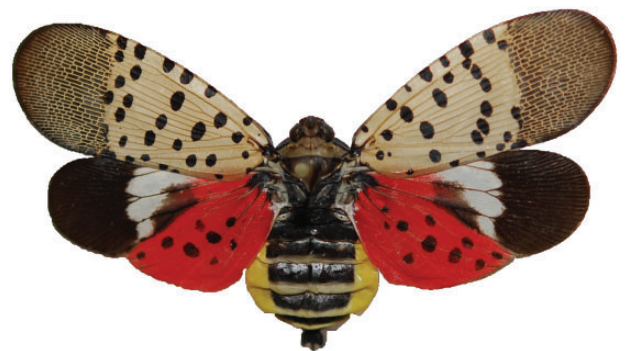
Fig. 3. Dorsal view of an adult female L. delicatula . The colorful hindwings and the black and yellow abdomen are not visible at rest.

Extensive feeding results in oozing wounds on the trunk (Fig. 6) and wilting and death of branches. Significant honey dew and sooty mold deposits around the base of trees are also noted from feeding of this insect (Fig. 7). Signs of infestation include the presence of ants, bees, hornets or wasps attracted by honeydew and tree sap.