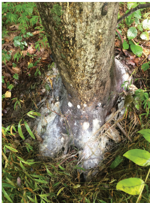
Fig. 7. Mold growing at the base of A. altissima . Large amounts of bleeding sap will accumulate on tree bases leading to growth of saprophytic fungi, or in extreme cases, thick mats of fungal growth.

There appears to be potential to use attractants and repellants to develop improved traps for monitoring or control purposes, although to our knowledge this has not been tested. In the laboratory Moon et al. (2011) reported that both nymphs and adults were highly attracted to spearmint oil at low doses (5 \mu l), which could be used to augment their control. Lee and Park (2013) also demonstrated attraction of this insect to a methanol extract of its preferred host A. altissima . Jang et al. (2013) reported that this species had a preference for lights with shorter wavelengths such as UV and blue lights. Yoon et al. (2011) evaluated several essential oils for repellency against L. delicatula . Only lavender oil