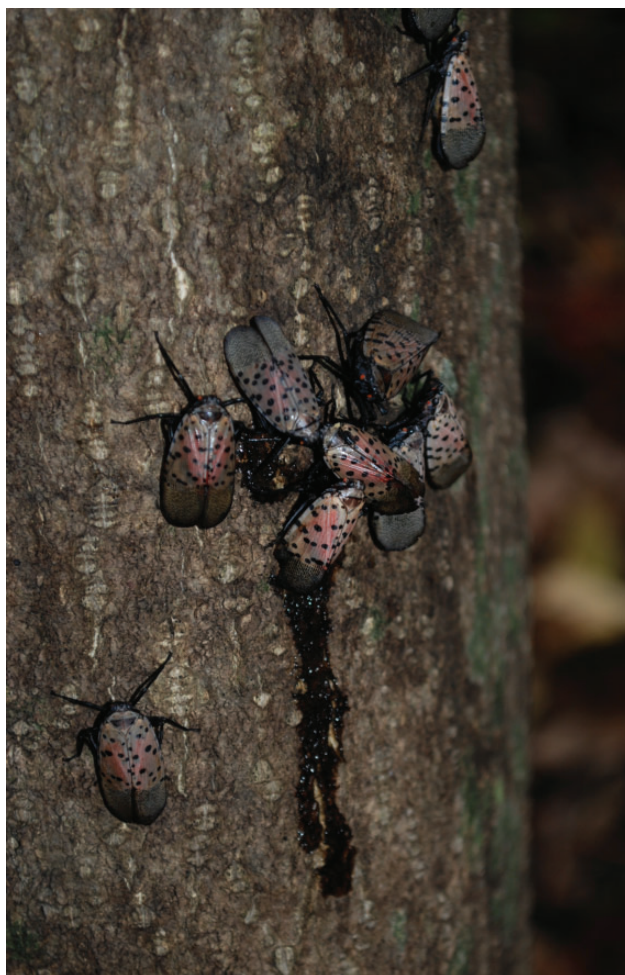
Fig. 6. Aggregation of L. delicatula on A. altissima . The dark liquid is tree sap oozing from feeding wounds caused by L. delicatula .

against L. delicatula . Pyrethrum, Sophora , and neem extracts (at 1,000 fold dilution) killed \geq 95\% of adults within 48 h, but the extracts tended to be less effective against nymphs in some tests (Lee et al. 2011, Choi et al. 2012). Control with reduced risk materials may be preferred in many urban or environmentally sensitive areas and will help reduce impact to beneficial species, but presumably requiring good coverage.